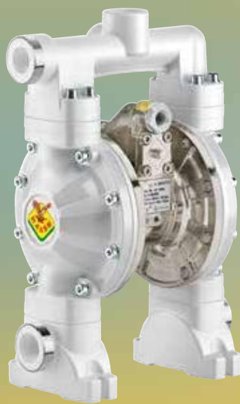
aluminum and polypropylene